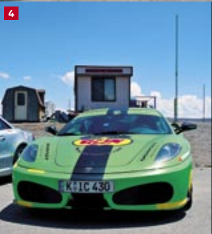
1. The second Carrera GT, also taking a well-deserved rest. 2. A Vanquish S waits with the rest of the cars at the California Speedway. 3. A Ferrari Testarossa at the California Speedway. 4. Fresh from the Gumball, a Ferrari F430 in Moab, UT.